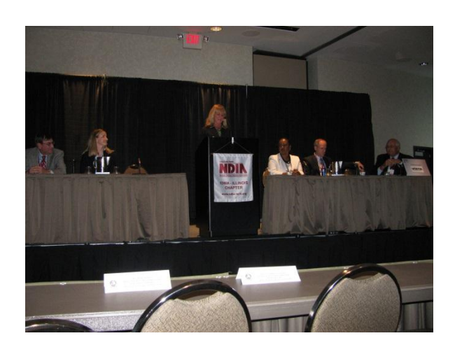
A panel of Prime Contractors describe what they expect from a small business seeking a business relationship.