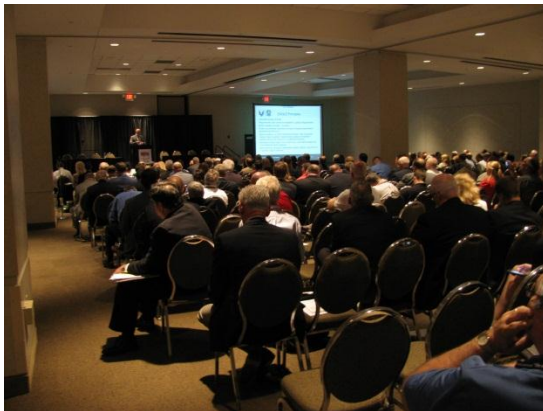
The large audience listens intently to the presenters.

Congressmen Bobby Schilling (left), 17th District in Illinois, and Dave Loeb sack, 2nd District in Iowa provide remarks and field questions from the seminar attendees.