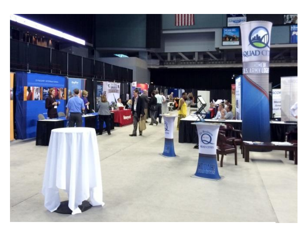
Above, you will note that we used almost the entire main arena to accommodate our 82 exhibitors. An improved layout and use again of padded carpeting, coupled with extensive networking breaks supported our even more exhibitor-centric focus this year.