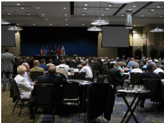
Full house at the Waterfront Convention Center